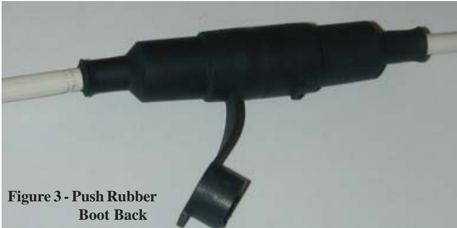
Figure 3 - Push Rubber Boot Back

3. Push the rubber boot back onto the tightening nut to provide protection against water ingress.