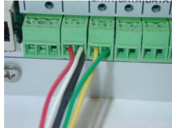
Figure 4 - Connecting to the Walker P1249 Wind Display

Memory: Nonvolatile memory for Speed Calibration, Direction Offset, Damping