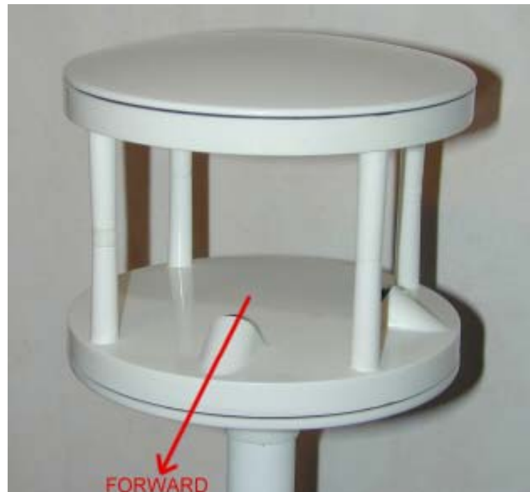
Figure 1 - Mounting Direction

2. Pull the rubber boot away from the female connector to uncover the circular tightening nut and screw the nut into the mating connector on the 40M cable as shown in Figure 2.