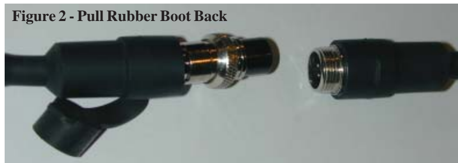
Figure 2 - Pull Rubber Boot Back

2. Pull the rubber boot away from the female connector to uncover the circular tightening nut and screw the nut into the mating connector on the 40M cable as shown in Figure 2.