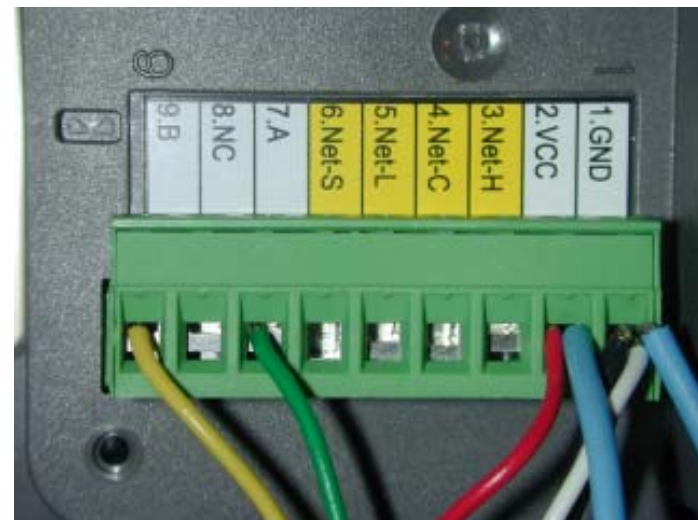
Figure 5 - Connecting to the Simrad IS80 Wind Instrument WI80